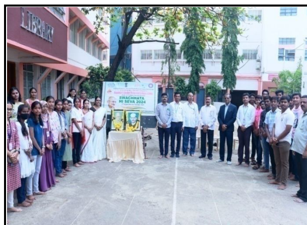
Students, teaching and Nonteaching staff participating in the Mahatma Gandhi and Lal Bahadur Shastri Jayanti program