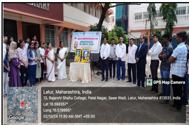
Students, Teaching and Nonteaching staff paying floral tributes to the image of the Mahatma Gandhi and Lal Bahadur Shastri