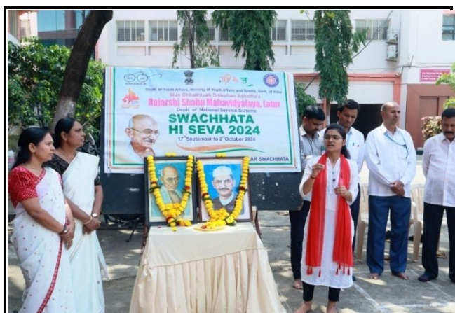
Students While reviewing work of Mahatma Gandhi and Lal Bahadur Shastri Jayanti program